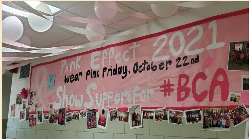
"Wear Pink" wall banner and hallway display at the High School.

Dressed in orange in observance of Every Child Matters.